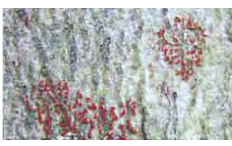
Infection by the fungus can reveal itself by the fungus's red fruiting bodies on the bark. Peter J. Smallidge

creates small circular cankers, within which the bark is actually dead. The tree can survive a few cankers, but as the number of points of infection increase, larger areas of bark may die. The movement of nutrients between the crown and roots (something that takes place just below the bark) decreases, and as bark dies and falls off, the wood below can rot. Many of the smaller beeches may actually survive the disease for a time, but they weaken and eventually decline. The situation can be very different with large trees. The disease tends to kill larger beech trees outright over just a few of years. This is how