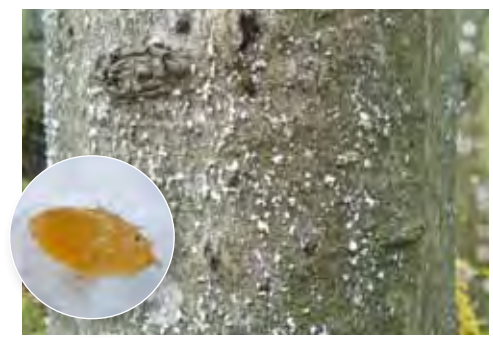
The tiny scale insects (one shown in inset) can live in large numbers on beech and conceal themselves with a protective white, waxy substance. Peter J. Smallidge

crowns of beech trees, leaving tell-tale scars in the bark with their claws. At the northern reaches of the beech's range, beechnuts are one of the most important, high-quality autumn food crops for bears. They are important because they determine the health of bears prior to entering hibernation. This, in turn can determine how well younger bears survive the spring following winter hibernation, and whether the adult female bears that have mated will give birth to any babies at all during the winter. Beechnuts can even determine how many of the babies that are born will survive, since the amount of milk that a mother bear produces can depend on her condition going into hibernation.