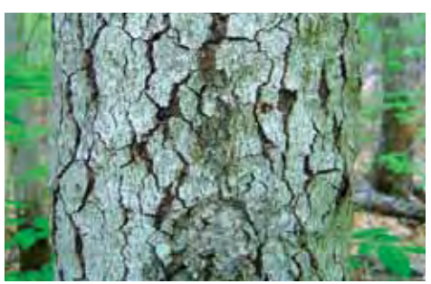
Beech bark disfigured and killed by beech bark disease. Peter J. Smallidge

particular are highly adaptable in their food habits and will seek out other food sources, settling on the next best one available. They could seek out, even at great distance, the acorns produced by Red Oak trees as an alternate, high-quality autumn food. This is something they might do anyway in years when there is no beechnut crop. But Red Oak, like beech, doesn't necessarily produce a crop each autumn. Add to this the fact that Red Oak is quite uncommon and local in some areas such as the western uplands of Algonquin Park, and this means that there may be more autumns without any readily-available highquality food. In the short term, this could mean that bears alive today may enter into hibernation in poorer condition. Younger bears may not have as high a chance of surviving the spring following hibernation. Females would give birth to cubs less often. In the long term, it could mean that Algonquin may not be able to support as many bears as it currently does (we estimate a population of 2,500 based on habitat conditions). We can only speculate that other species of wildlife that depend heavily on beech will face a similar outcome.