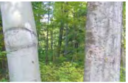
The canker-free tree on the left is resistant to the disease. The tree on the right is diseased.

face a big challenge in attaining nut-bearing size since they can grow so densely that they prevent each other from growing to full potential. Add to this the fact that these suckers are genetic clones of their parent, and so they may be just as susceptible to BBD once they get larger. Can they eventually gain resistance to the disease? Will the disease weaken with the passage of time? That could happen, but we don't know. Where there is a glimmer of hope is the fact that a small number (approximately 1%) of mature beeches appear to be resistant to BBD and continue to stand unaffected alongside their maimed and dead peers. We assume this resistance is due to genetics. It is possible that these trees can give rise to future generations of disease-resistant trees in some way; however, we don't know exactly if this could happen either.