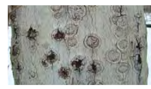
Cankers on beech tree. Peter J. Smallidge

We don't suggest that wildlife that uses beechnuts will simply starve and disappear because of the death of beech trees. Bears in