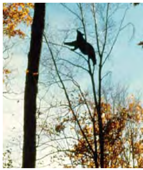
Black Bear feeding on beechnuts. Jeremy Inglis

even be inclined to look very closely at trees at all. But we think that the beech deserves attention for various reasons. As one of our most widespread trees, beech adorns our woodlands with its unique, smooth grey bark, which gives the trunks of older trees the appearance of "elephant legs". It is difficult to walk by one of these without giving it at least a casual glance of appreciation. If you are not at least convinced of its beauty, let us suggest that beech provides valuable services to wildlife, including many quite noticeable species. Old beech trees provide great habitat for birds that excavate nesting cavities such as the Pileated Woodpecker. Perhaps more importantly, beech trees provide upwards of 40 forms of wildlife with a feeding bonanza in the form of a beechnut crop that is