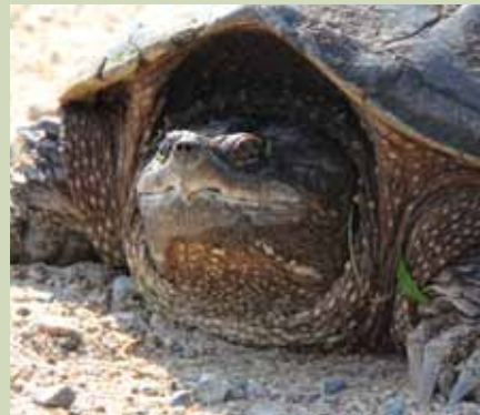
Snapping Turtle: Be careful to avoid its jaws as it will feel threatened and may snap!