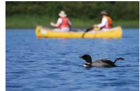
Algonquin's lakes provide great opportunities to watch loons.

is that due to climate change western Canada is heating up faster than eastern Canada. This may be increasing methylmercury production more in the west over time by increasing microbial activity or by favouring other methylation pathways.