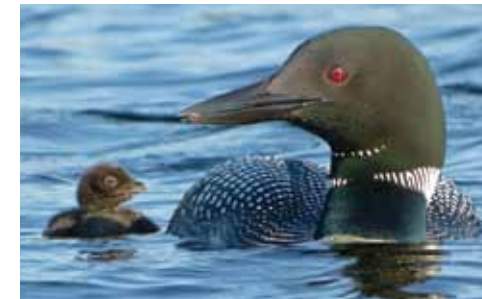
Help the Algonquin Loon Survey by reporting lakes with loon nests or young.

The haunting calls of the Common Loon symbolize Algonquin's wild country for many people. Nearly every small lake has a breeding pair and there are multiple pairs on the larger lakes. Unfortunately, there are environmental threats to loons throughout their range that could potentially affect numbers here in the Park. These include reduced reproductive success caused by acid precipitation, and loons dying during migration due to avian botulism.