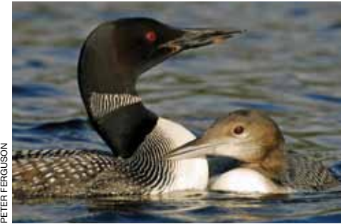
Common Loons produce fewer chicks in lakes impacted by pollution.

The same is true for acid precipitation. Acids, and the toxic metals they mobilize, interfere with fish gill function. This, in turn, reduces fish growth, reproduction, and survivorship, and results in lower fish abundance in more acidic lakes. As a result, Common Loons produce fewer chicks on acidic lakes.