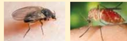
Blackfly biting (L) and mosquito feeding (R)