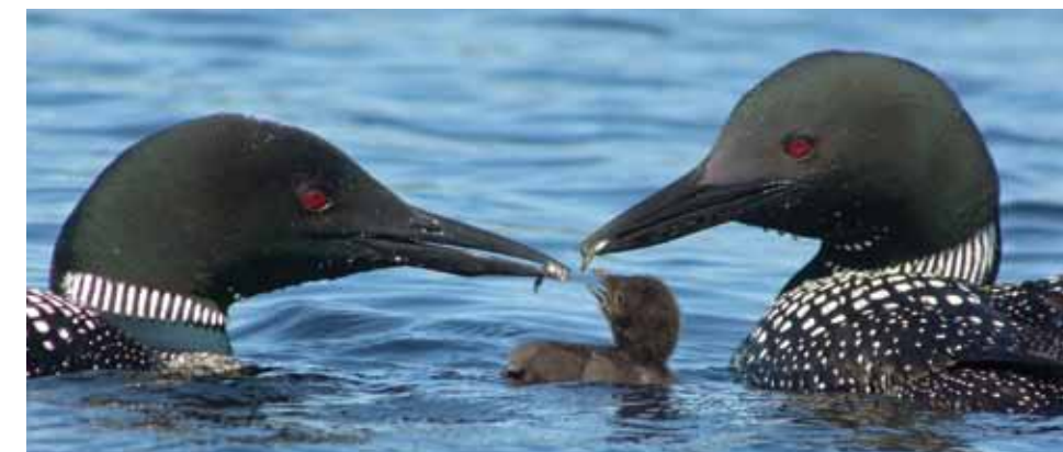
A pair of Common Loons feeding their young.