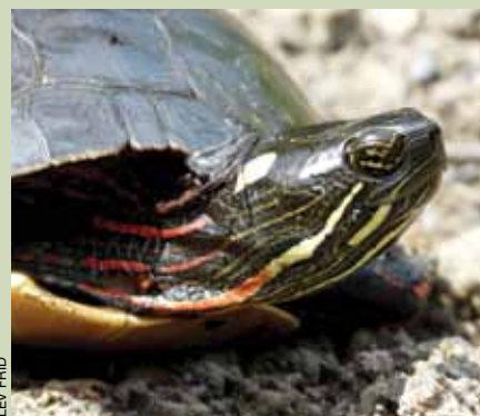
Painted Turtle: Note the brilliant colours!

Anyone driving along the Park's Highway 60 corridor will notice the black drift-fencing that has been temporarily installed in various places by both Park staff and construction contractors working on the highway. It is intended to keep Snapping and Painted Turtles off of the roadway in an attempt to reduce their mortality. These turtles prefer soft ditches and banks of roads for nesting.