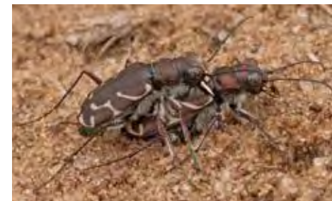
Oblique-lined Tiger Beetles mating.

species use similar habitats, insects have ways of avoiding direct competition with each other. Many have seasonal activity, meaning they emerge at particular times of year, and sometimes are present in that life stage for only a few weeks. Tiger Beetles are active during the warm season, but depending on the species we do see some patterns emerge. Many species are active as adults at the height of summer only and over-winter as larvae in a burrow. The remainder are active both spring and fall, but with different generations of larvae reaching adulthood in either season (see table). Those spring and fall active species usually over-winter as adults or larvae and many species require a year, and sometimes two or more years, to complete development.