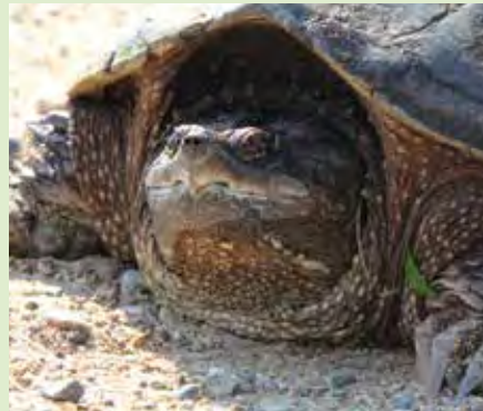
Snapping Turtle: Be careful to avoid its jaws as it will feel threatened and may snap!