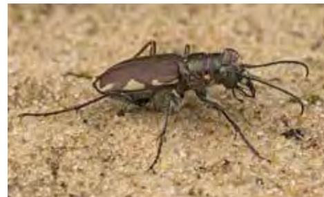
Festive Tiger Beetles usually have a distinctive triangular shaped mark on the side of the body (middle marking).

digest the prey before it is even swallowed. Apart from being amazing predators, they are also strikingly patterned, having dark elytra (the wing covers on the back) and white or ivory coloured markings unique to each species. The combination of their ferocious appetites and appearance, and beautiful patterns is how they got the name Tiger Beetle.