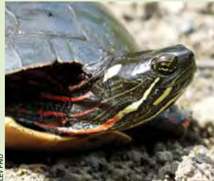
Painted Turtle: Note the brilliant colours!

Anyone driving along the Park's Highway 60 corridor will notice the black drift-fencing that has been temporarily installed in various places by both Park staff and construction contractors working on the highway. It is intended to keep Snapping and Painted Turtles off of the roadway in an attempt to reduce their mortality. These turtles prefer soft ditches and banks of roads for nesting.