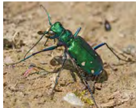
Six-spotted Tiger Beetle with prey.

maintain high body temperatures, nearing their limits, up to 39°C (human body temperature is 37°C). Tiger Beetles have a few interesting body postures they use to help warm up on cool mornings, such as crouching down so their abdomen is in direct contact with the warm sand. As the ground warms and a layer of warm air rises just above the surface of the sand, they stretch out their legs and raise their body, in a position called stilting. If it gets too warm, they must try other positions to cool off. The beetle may continue stilting, but orient itself towards the sun, minimizing the portion of its body exposed to it, known as sunfacing. If temperatures get hotter still, the beetle may head for damp soil, some shade under plants or even dig a shallow burrow to escape the heat.