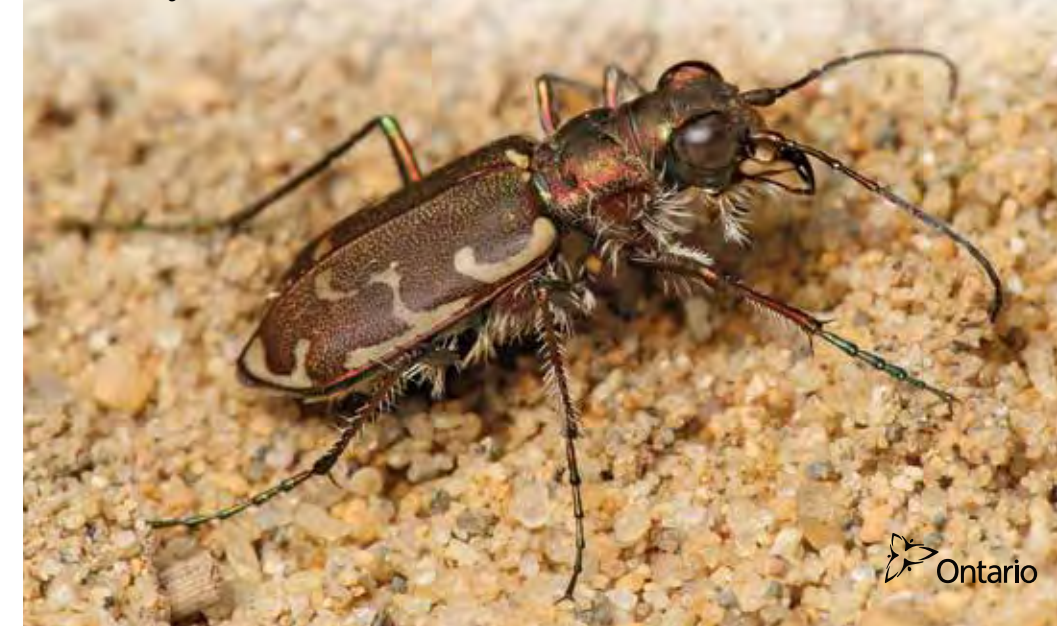
Bronzed Tiger Beetle

While walking the shores of lakes or hiking a trail, you may notice insects flying away very quickly but staying close to the ground. These really do look like house flies, and we usually don't give them much thought. If we watch them, we might observe them flying to where the vegetation meets the edge of the path. If you are really observant or watching through binoculars, you might even see that the insect in question has flown in an upside down "J" pattern, and has hooked back around to look at you! Surely, this is no house fly – it's a tiger!