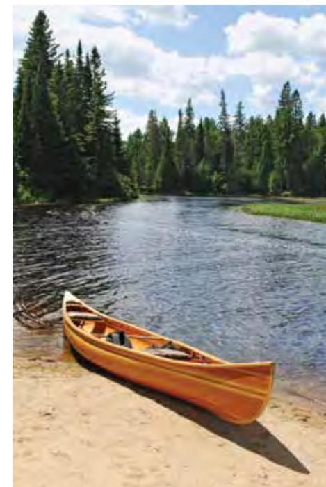
The sandy shores of an Algonquin river – a fine spot to enjoy a picnic, for both humans and Tiger Beetles alike.

If you are interested in observing Tiger Beetles in the wild, we have a few tips for you. Firstly, find a sunny, open area such as a beach, sandy trail, or even a rock face. Next, try to get there early in the day – before it gets too hot, the beetles will be a bit sluggish (well, sluggish for a Tiger Beetle!). As you search for