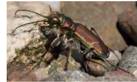
Cow Path Tiger Beetle.

the beetles, you will inevitably flush one from its resting spot. Watch for the characteristic “J” flight, and pay attention to where it lands. Stay back; you don’t want it to fly off again. Now, raise your binoculars and have a look at this tiny tiger on the edge of the path! The next time you are walking the shore of a lake and happen to see an insect quickly take off, follow its path to watch it turn to look at you – it might just be a tiger!