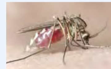
Blackfly (top) and mosquito (bottom).