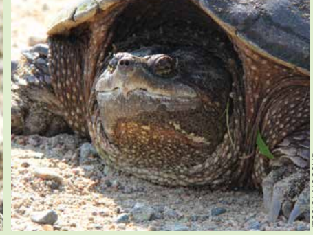
Snapping Turtle: Be careful to avoid its jaws as it will feel threatened and may snap!