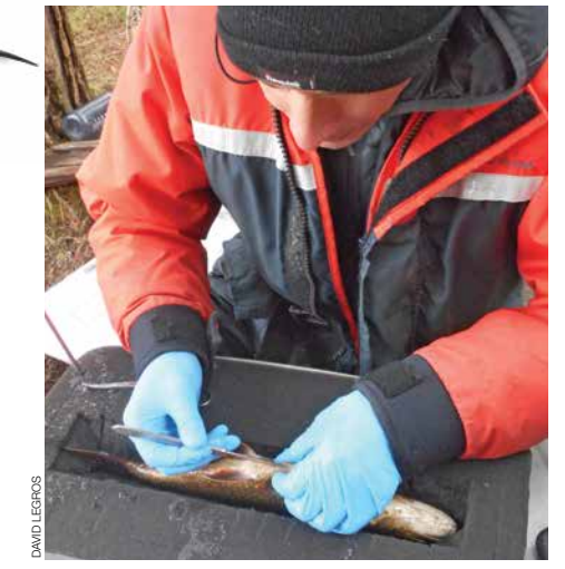
Fisheries researcher implanting transmitter.

In May 2017, fisheries researchers caught 20 Lake Trout and 10 Smallmouth Bass and surgically implanted them with acoustic transmitters. The transmitter (about the size of one AAA battery) emits a unique sound frequency every 5 to 10 minutes. The sound from the transmitter is picked up by acoustic receivers in the lake, which are installed one metre below the surface of the water.